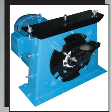
VK PowerMax Blast Wheel