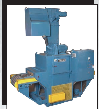
Custom CB 2406 Shown Below