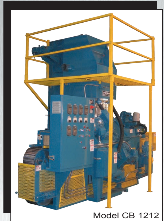
Model CB 1212

When blast cleaning small or intricate parts that cannot withstand tumbling, a chain mesh belt system can process parts quickly with minimum trauma. Pass-through blast cleaning systems are also easily customized to suit specific product menus and space availability.