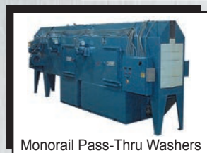
Monorail Pass-Thru Washers

VIKING BLAST AND WASH SYSTEMS RESERVES THE RIGHT TO CHANGE ITS PRODUCTS OR SPECIFICATIONS AT ANY TIME WITHOUT NOTICE OR OBLIGATION.