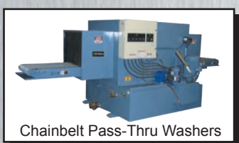
Chainbelt Pass-Thru Washers