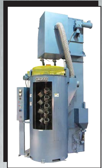
SH 1545 Indexing Spinner Hanger