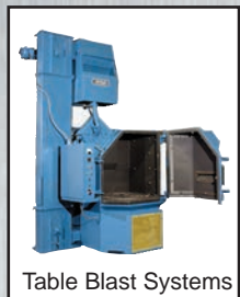
Table Blast Systems