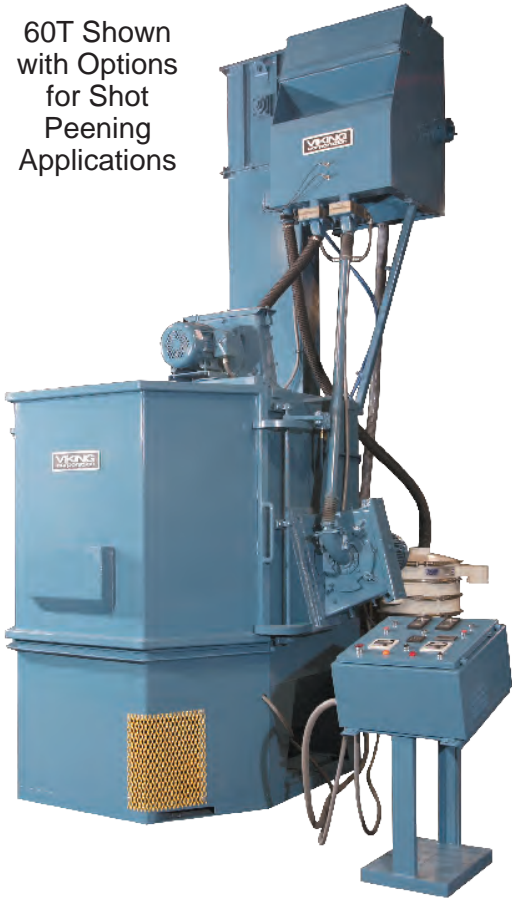
60T Shown with Options for Shot Peening Applications

Viking's Table Blast models are the ideal choice for a wide variety of parts that are not suitable for tumbling due to size and shape. Parts are rotated on the table and are cleaned by exposure to the abrasive blast.