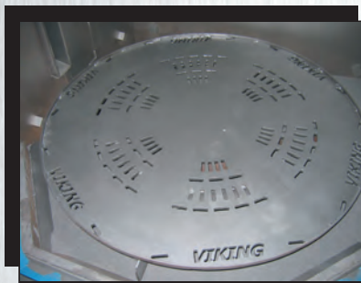
Table is lined with a self-draining, 3/8" thick manganese alloy plate