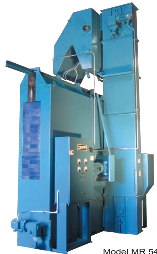
Model MR 5412