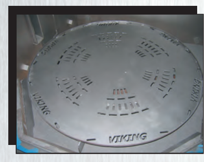
Table is lined with a self-draining, 3/8" thick manganese alloy plate