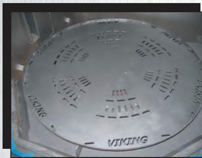
Table is lined with a self-draining, 3/8" thick manganese alloy plate