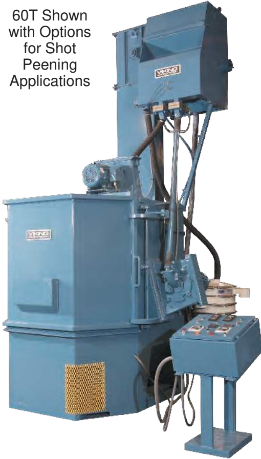
60T Shown with Options for Shot Peening Applications

Viking's Table Blast models are the ideal choice for a wide variety of parts that are not suitable for tumbling due to size and shape. Parts are rotated on the table and are cleaned by exposure to the abrasive blast.