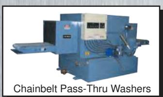
Chainbelt Pass-Thru Washers