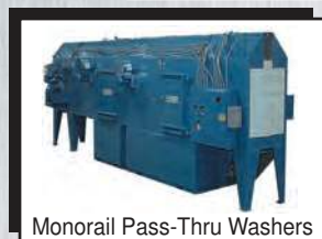
Monorail Pass-Thru Washers