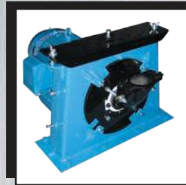
VK PowerMax Blast Wheel

Steel Belt Tumble Blast Systems are also available (shown right)